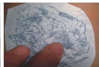
Apply your design