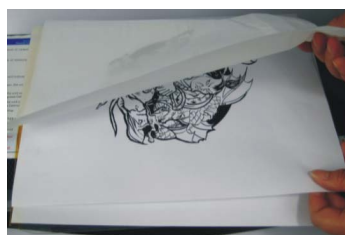
Place artwork into stencil paper and insert into carrier